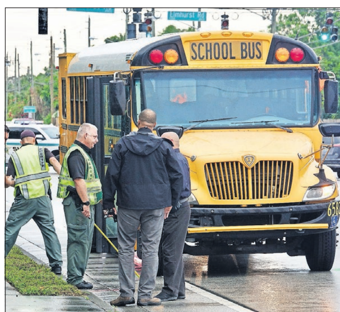
Deputies investigate the fatal accident on Haverhill Road south of Elmhurst Road on Wednesday morning.