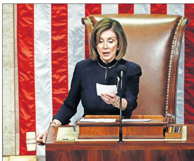
House Speaker Nancy Pelosi, D-Calif., announces the passage of article II of impeachment against President Trump.